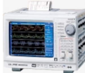
DL708E/716 Scope Coder

16 Analog Channels + 32-Bit Logic Input, 256 Million Data Point Max. Memory, 10 GB SCSI HDD and 10MSPS Max