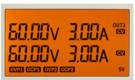
Figure 2. Backlight on/off feature with dual reading (voltage and current) on an LCD display