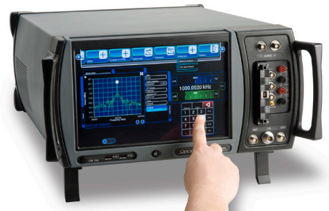
Figure 2: State-of-the-Art Touch-Screen User Interface

With a 12.1 inch high resolution touch screen based user interface, the 7215 provides the most advanced and user friendly operator interface in the industry. It’s highly intuitive design is a result of extensive research and development focused on user experience, graphical design and content depiction, and modern user interface techniques applied to the unique needs of test instrumentation and its operating environments.