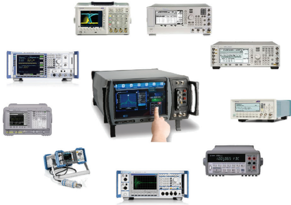
Figure 1: The 7215 takes the place of an entire suite of test equipment