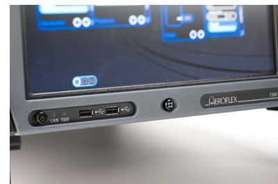
Figure 3: LXI Class B compliant with IEEE 1588 synchronization of better than 50 ns over Ethernet

Unless they add significant value for our customers, Cobham prefers to avoid proprietary components and interfaces. That is why the 7215 was developed to leverage a broad number of open industry standards for both hardware and software components.