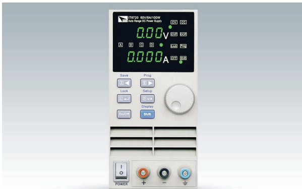
IT6720 60V/5A/100W IT6721 60V/8A/180W