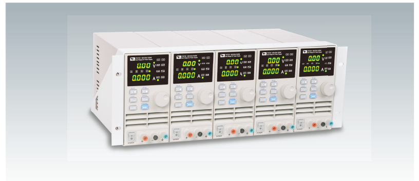
IT-E152 19" Rack Mount Diagram