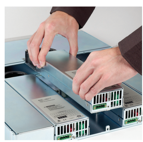
Figure 6c. User re-configurable modular system

www.keysight.com/find/N6783A-BAT www.keysight.com/find/N6783A-MFG and download the N6783A-BAT Data Sheet , 5990-8662EN and the N6783A-MFG Data Sheet , 5990-8643EN.