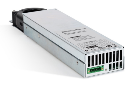
Figure 6a. The basic series

The Keysight N6750 Series of highperformance, autoranging DC power modules provides low noise, high accuracy and programming speeds that are up to 10 to 50 times faster than other programmable power supplies. In addition, Keysight has, for the first time, included high-speed test extensions in generalpurpose power supplies. The high-speed test extensions offer an oscilloscope-like digitizer that simplifies system configuration and increases measurement accuracy when viewing high-speed transient or pulse events within the DUT. In addition, autoranging output capabilities enable one power supply to do the job of several traditional power supplies.