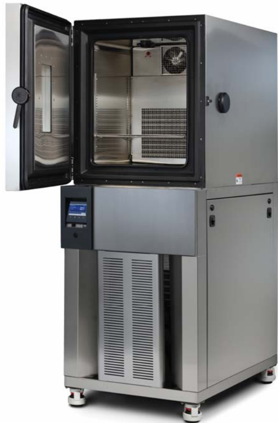
Shown with optional features: window, shelf, cable access port on right (instead of left)

The BTZ-4200 can save 15 minutes or more per cycle, compared to our BTZ-175 model.