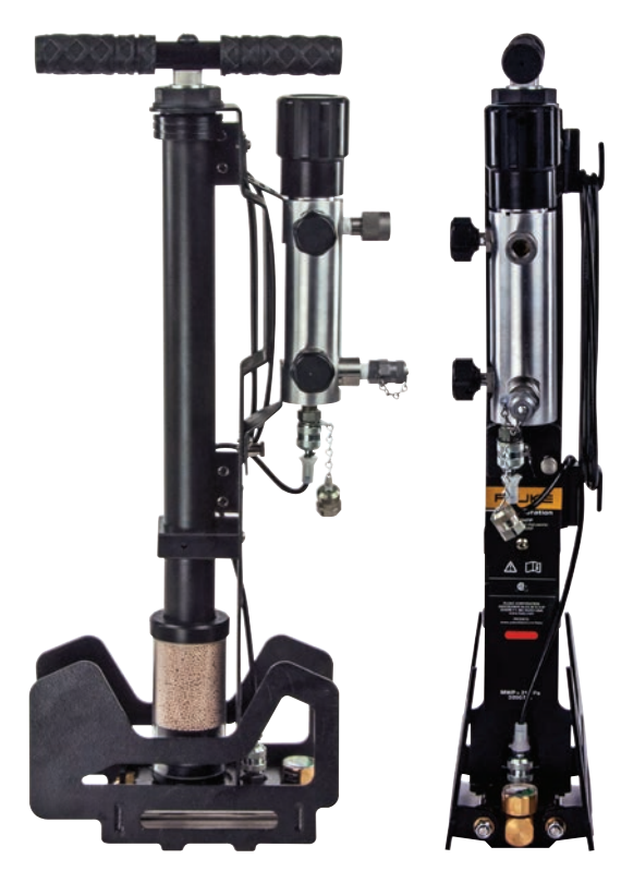
The 700HPPK features collapsible feet that make it easy to pack away.