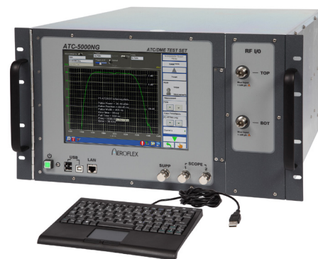
Standard accessories include keyboard with touchpad.