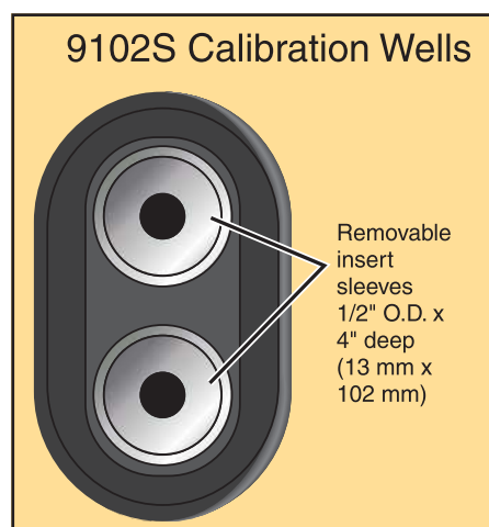
9102S block configuration. Instrument includes 1/4" and 3/16" inserts. Order additional sizes as needed.