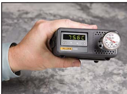
Take the 9100S anywhere. It's the smallest dry-well in the world.

Since we introduced the world's first truly handheld dry-well, many have tried to duplicate it. Despite its small size (57 mm [2¼ in] high and 127 mm [5 in] wide) and light weight, the 9100S outperforms every dry-well in its class in the world.