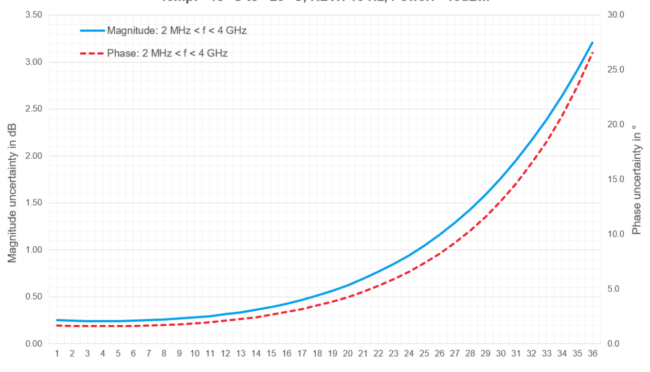
Uncertainty of reflection measurement with R&S®ZN-Z103 calibration unit