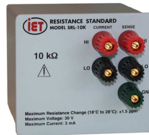
SRL-10 kΩ High-Accuracy Resistance Standard