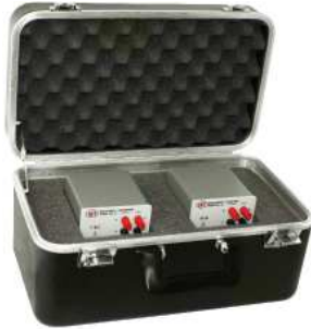
SRC-100 Transit Case for 2 units

changes during transportation or shipping. It is suitable for transporting and storing two or more units.