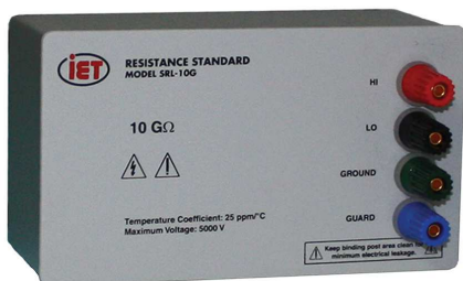
SRL-10GΩ High-Accuracy Resistance Standard