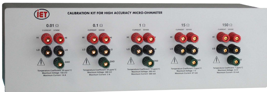
SRL-Series High-Accuracy Resistance Standard Combination Unit