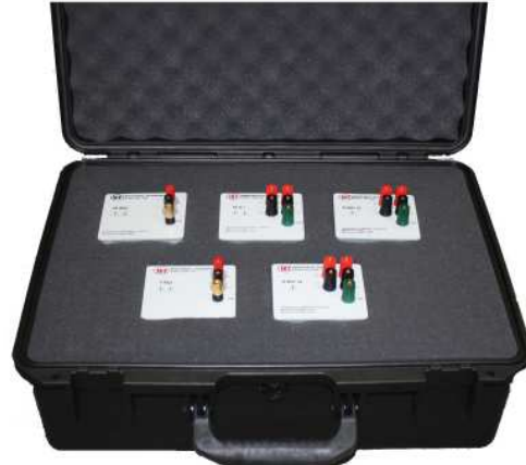
SRC-10-n Transit Case for n units (5 units shown)