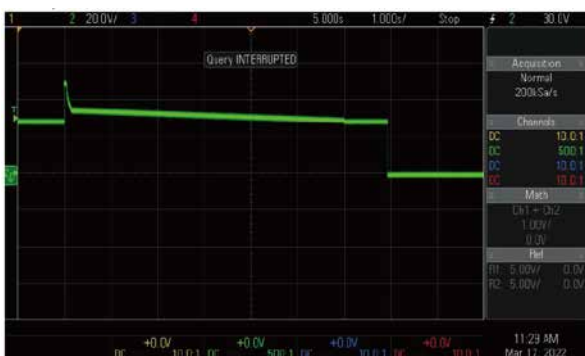
LDC302 28V abnormal voltage transients (overvoltage)