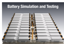
Battery Simulation and Testing

The i-BEAM Series is designed for testing today's complex, high power electronics for the automotive, energy storage, industrial, and aerospace markets in a variety of applications. This platform covers all test needs through the product life cycle from advance research and development (R&D), to design validation, and production test requirements.