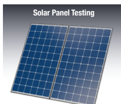
Solar Panel Testing