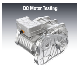
DC Motor Testing