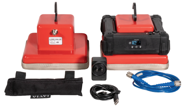
OSPREY Dual Coupler Kit with accessories