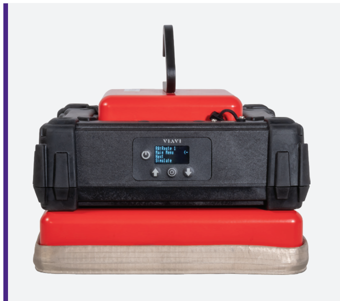
OSPREY Standalone GPS Simulator

The OSPREY GPS Simulator Controller can also be purchased and used without the VIAVI GPS coupler, for use with your existing coupler or via direct connect.