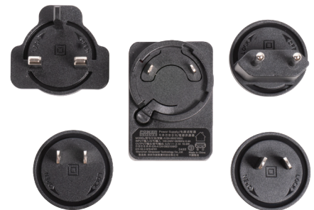
A variety of wall power adapters are included