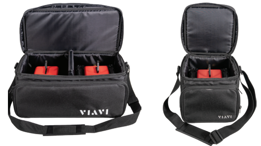
Dual and single coupler carrying cases available

Directly plug-in the OSPREY to your GPS and use as a standalone GPS Simulator