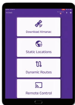
Remote application home screen